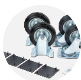
Castor kit CAS160-KS-FX-SB-CP