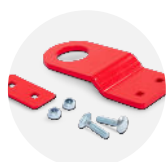
Crane lifting eyes CLEK